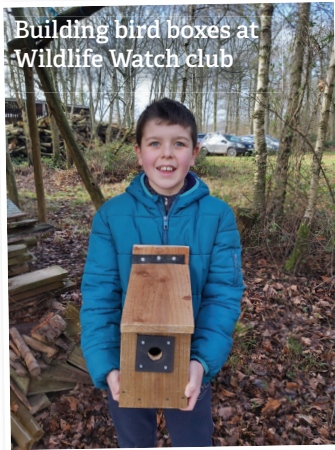
Building bird boxes at Wildlife Watch club

Our members and supporters will be better connected to nature through our visitor centre, flagship nature reserves, events and learning experiences.