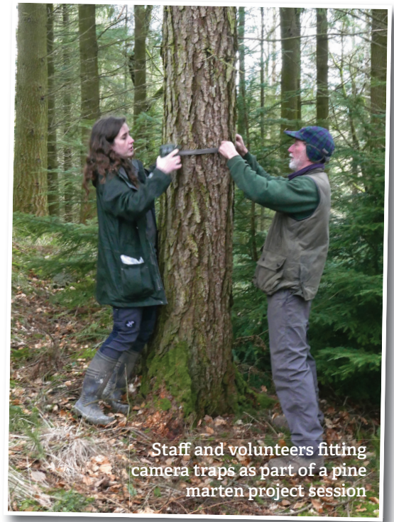
Staff and volunteers fitting camera traps as part of a pine marten project session

Our land advice service will support farmers to transition to more sustainable, nature-friendly practices that work for their business.